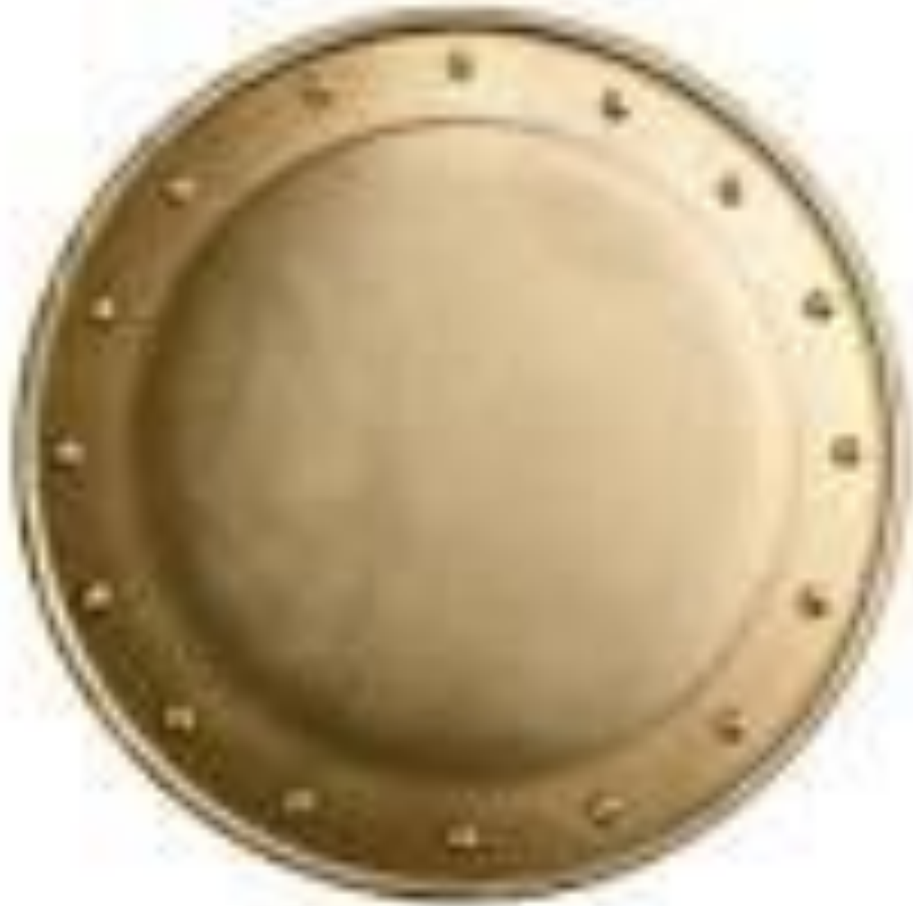
Illustration of a circular object with a central flat area and a raised outer rim, possibly a lid or a small drum.