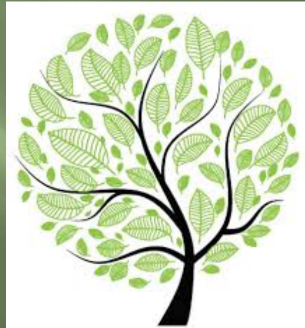
A tree planted by the water

Blessed is the one who trusts in the LORD, whose confidence is in him.