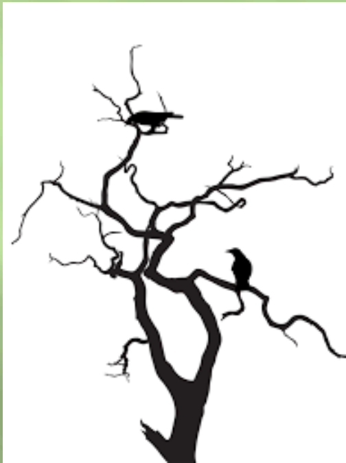
A bush in the wastelands

Cursed is the one who trusts in man, who draws strength from mere flesh and whose heart turns away from the LORD.