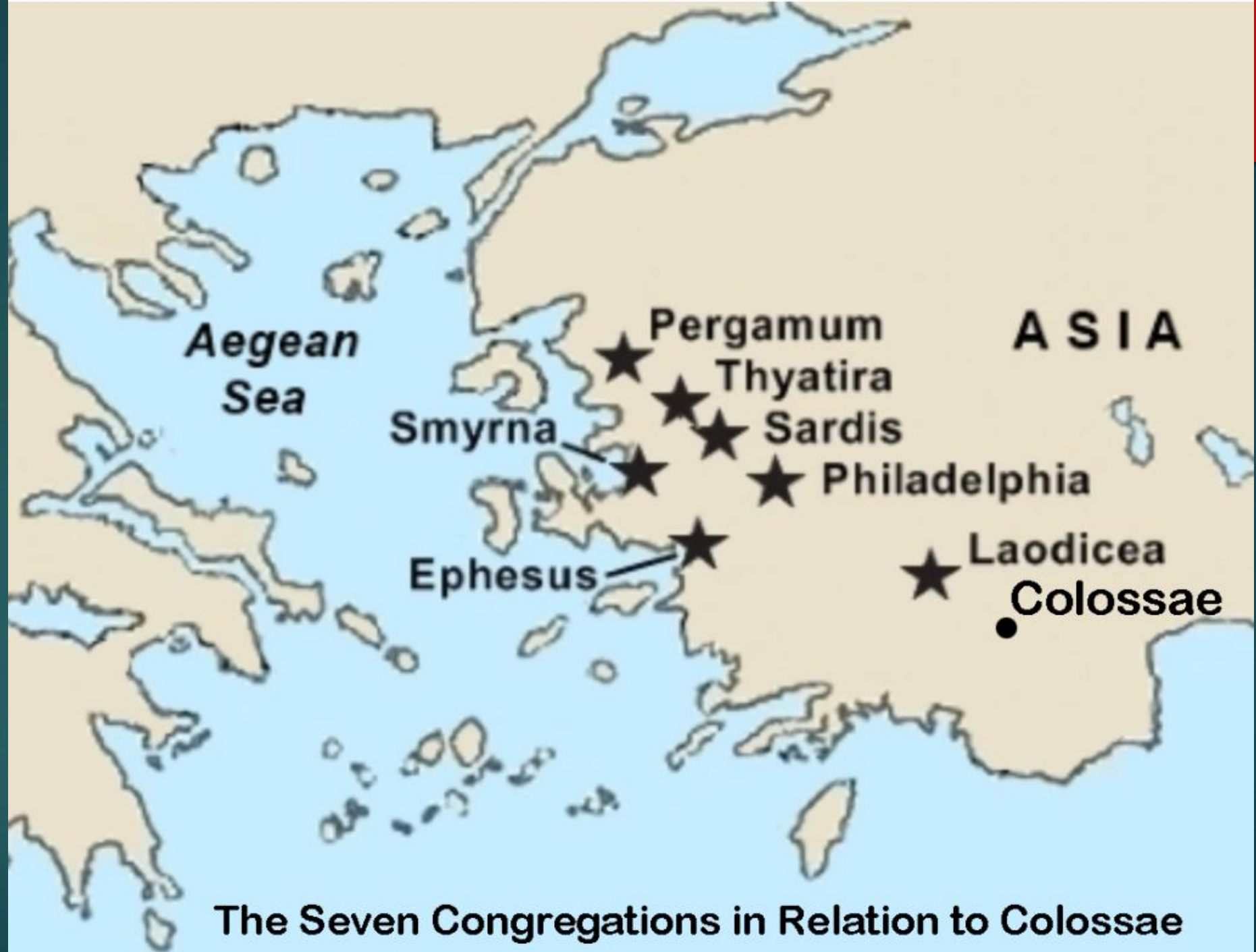
The Seven Congregations in Relation to Colossae